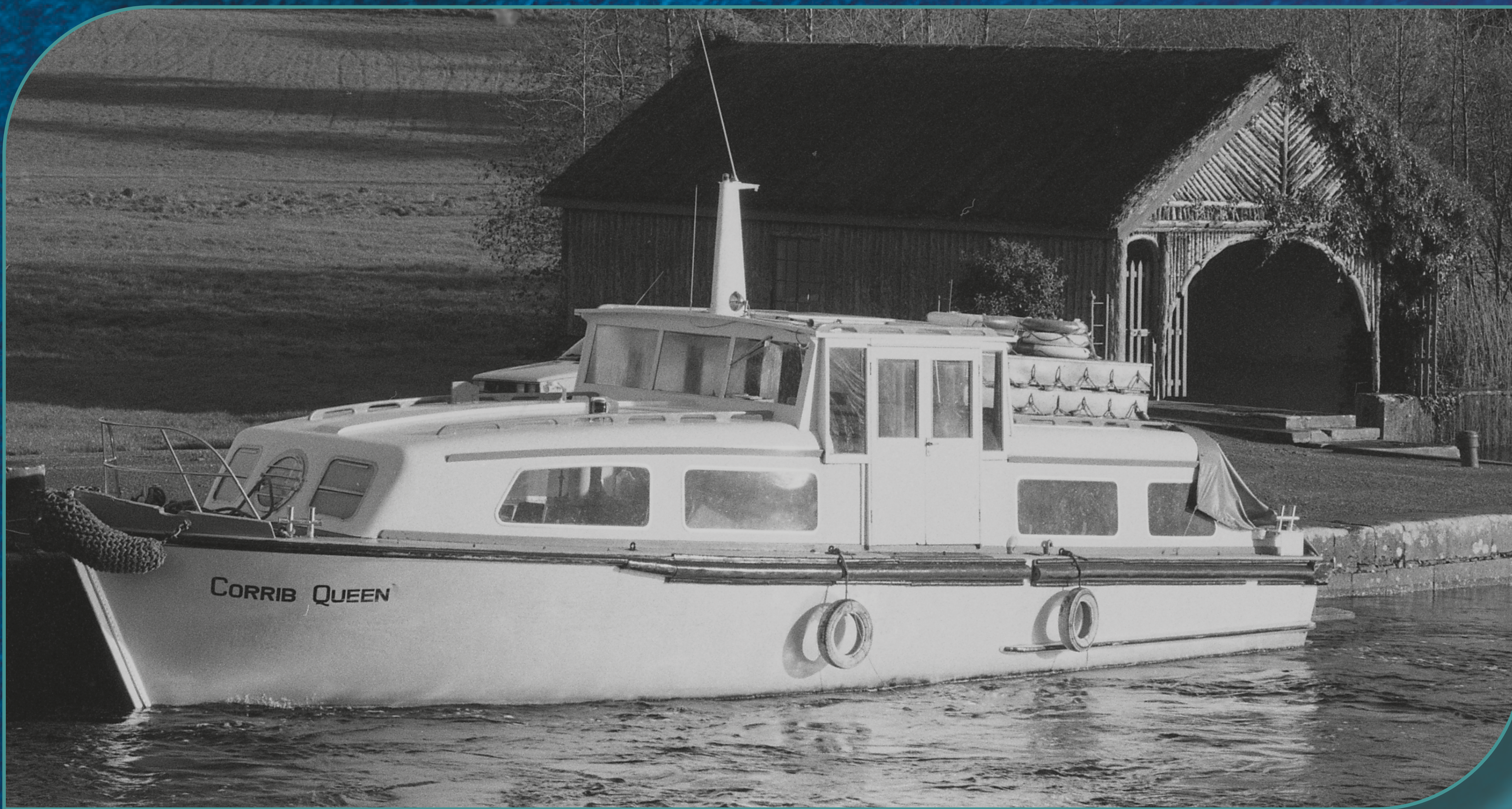
John's first boat the Corrib Queen

Photo Courtesy The Liam Lyons Collection. For enquiries please email info@liamlyons.com