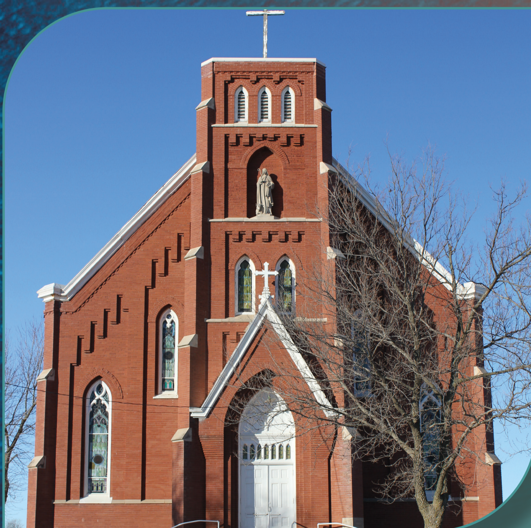
Church at St. Bridget notable for its unfinished steeple