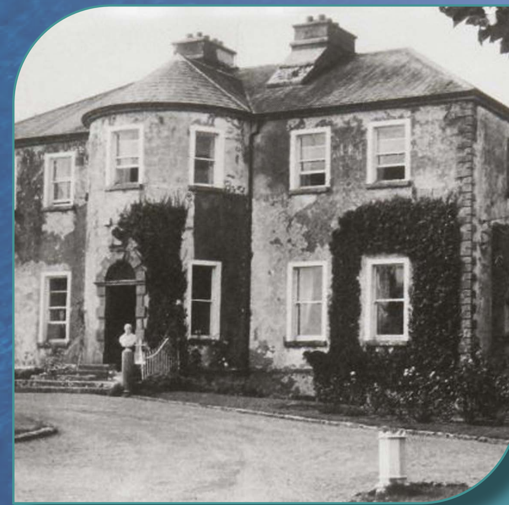
Lisdonagh House, Headford, Co. Galway