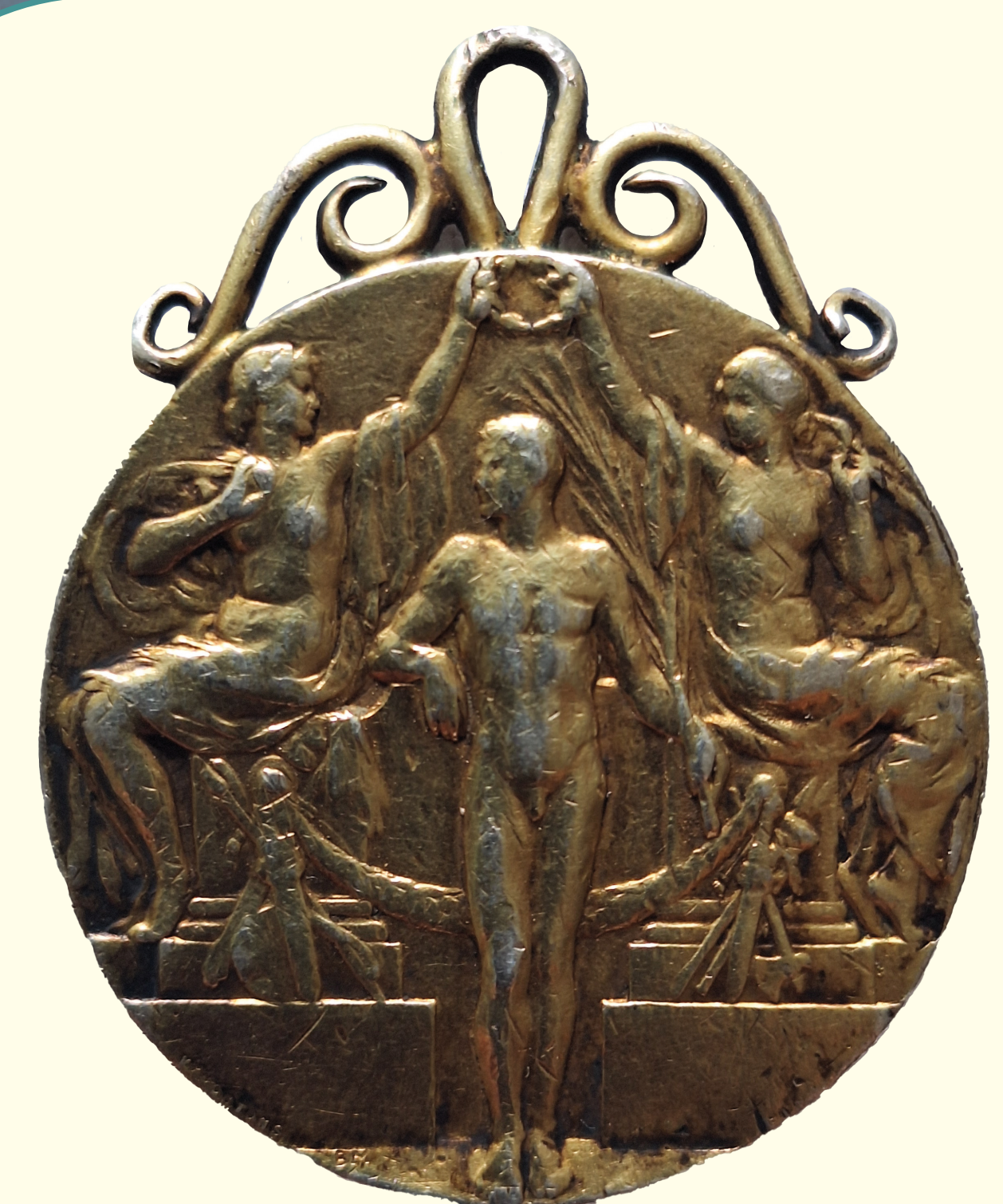
Obverse side of Hynes' 1912 Olympic Tug-of-War Silver Medal.

Photo has been colourised